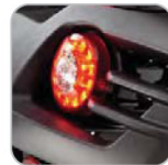
New rear LED light