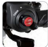
Handlebar mounted switch for selecting 4x2 - 4x4 and front differential interlock