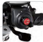
Handlebar mounted switch for selecting 4x2 - 4x4 and front differential interlock