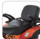
Passenger backrest & handlebars