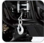
3000 / lbs winch with handlebar control