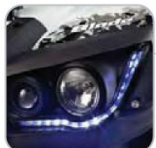
New front LED light