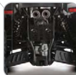
Adjustable dual rear shocks