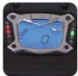
Multifunction digital instrumentation

Drivetrain 4x4 FULLY INDEPENDENT REAR SUSPENSION