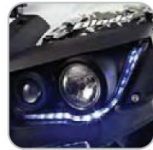
New front LED light