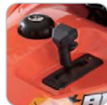
Parking gear lock