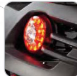
New rear LED light