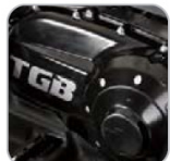
503cc. EFI Engine

Drivetrain 4x4 FULLY INDEPENDENT REAR SUSPENSION