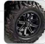
All new 14" rims