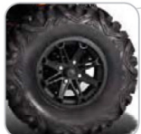
All new 12" rims