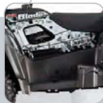
Extended frame (+ 18 cm)